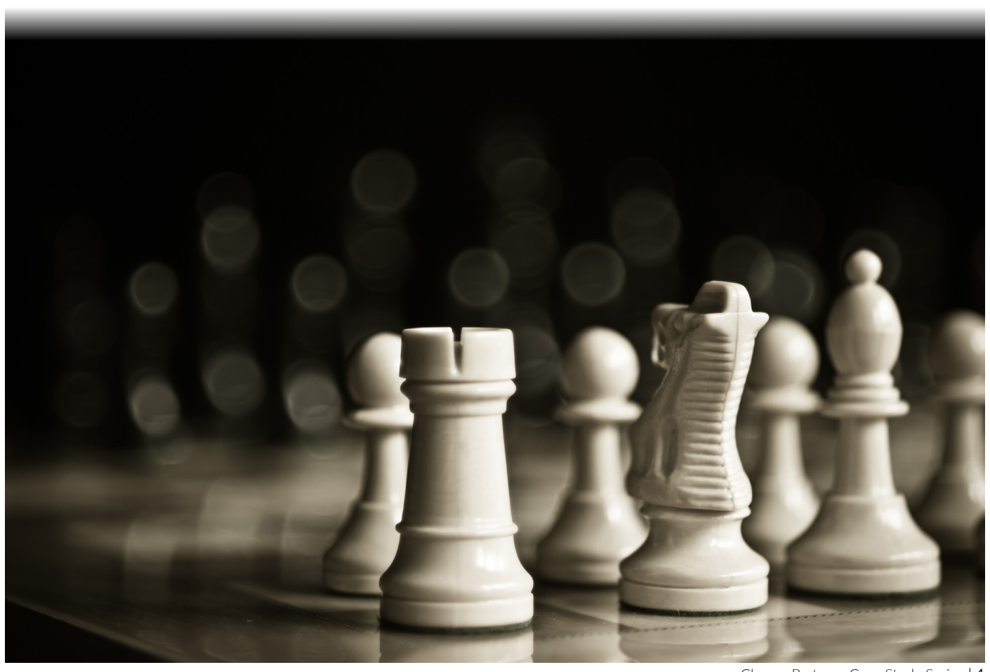
Chazey Partners Case Study Series | 4